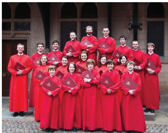
At Eaton Hall

I am delighted that the Friends have been able to fund the purchase of new choir