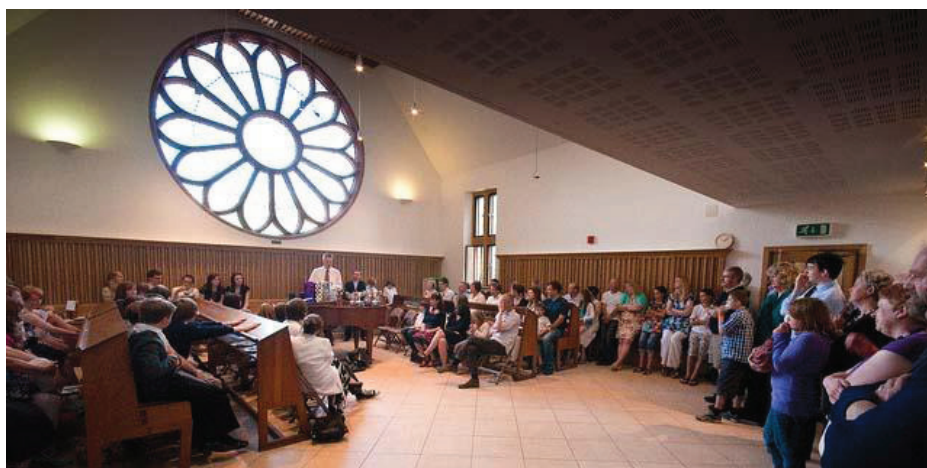
Choir Prizegiving in the Song School